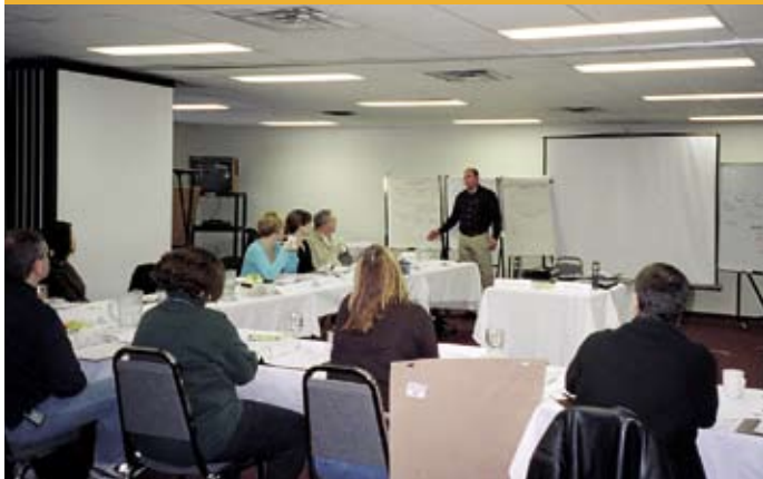
In 2005, twenty-one members of Saskatchewan's production community attended the inaugural edition of the program.

SaskFilm is offering a second session of Saskatchewan's Business & Executive Leadership Development Program presented by and modeled after the prestigious Banff Executive Program. The five-day program provides a targeted, intensive agenda aimed at developing business acumen and leadership skills in the film, television and interactive industry.