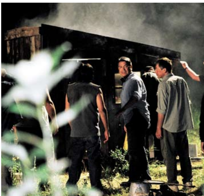
Episode 5 of Rabbit Fall .