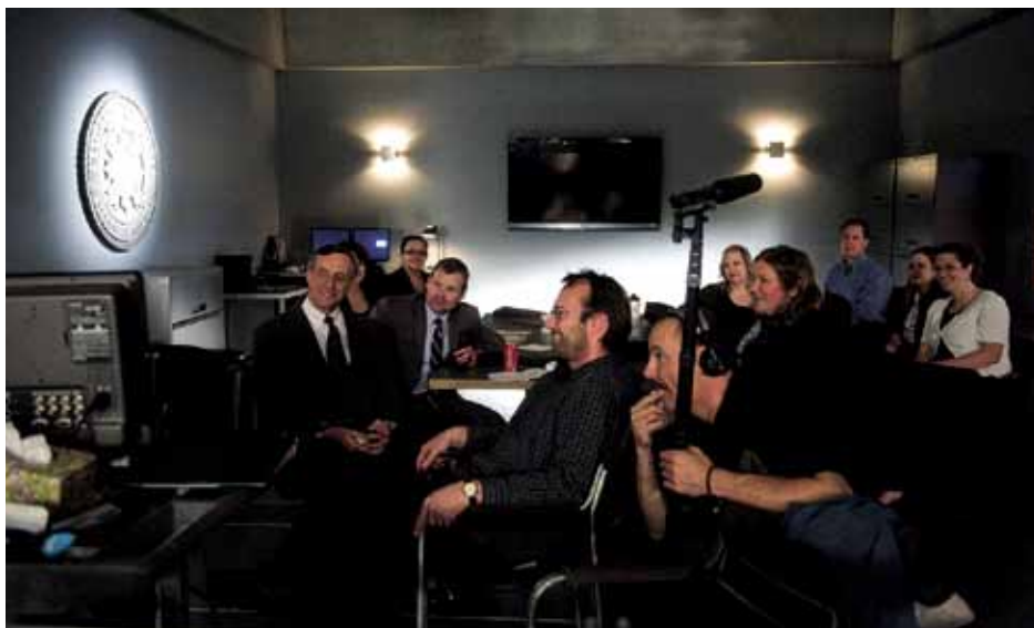
Guests get a behind the scenes glimpse of InSecurity .