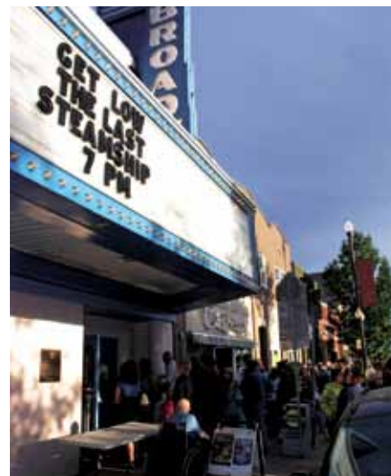
People turned out in droves for the premiere screening of The Last Steamship: The Search for the SS City of Medicine Hat at the Broadway Theatre in Saskatoon on September 3, 2010.

L: Amazing. We had no idea what the turnout would be and were crossing our fingers to just fill half the house! It was wonderful to see so many come out and support a project about an exciting piece of our history. It was about finally getting to see two years of hard work come to fruition and more importantly, being able to say a very public thank you to everyone who supported the project from the start, who put