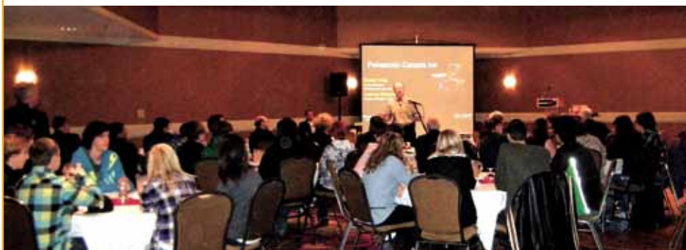
SaskInteractive 2010 drew nearly 100 delegates from the interactive, film and TV industry, as well as from government and education.

Many connections were made between communities and both business and creative conversations started that are hoped will lead to the proliferation of exciting transmedia content being produced in Saskatchewan.