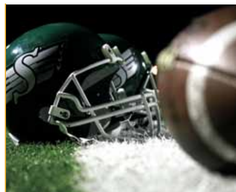
Saskatchewan Roughrider gear waits dramatically on the field.

The one-hour centennial documentary was screened at a premiere event to an enthusiastic audience that included former and current