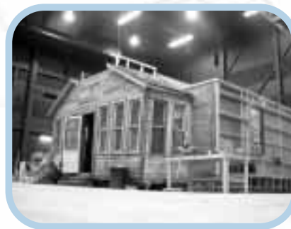
Tideland in production in Studio 4 in the Canada Saskatchewan Production Studios

Established in 2002, the CSPS is a purpose-built facility located within a 2,300 acre lake side park just ten minutes from the central business district in the city of Regina. The facility offers four stages of varying sizes totaling 30,475 square feet, 42 foot ceiling heights, fully furnished production offices, and a complete array of support facilities and services including wardrobe, art department, carpentry, paint, makeup/hair, set storage and breakdown area, camera lock-up, VIP dressing rooms, green rooms, lunch space and on-site cafeteria.