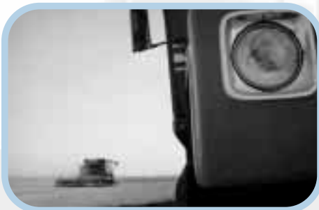
Two Museums / Arid Sea Productions