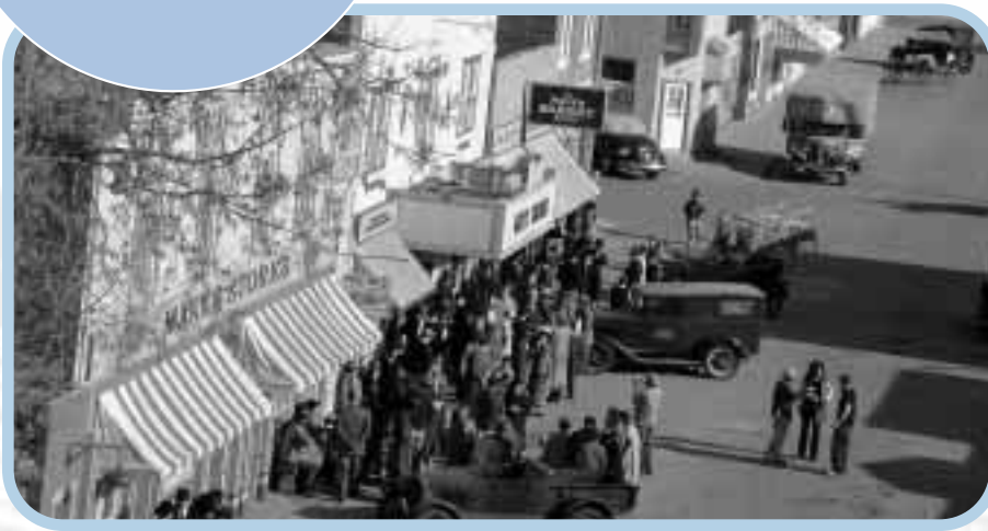
(from top to bottom, left to right)