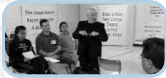
(from top to bottom, left to right)