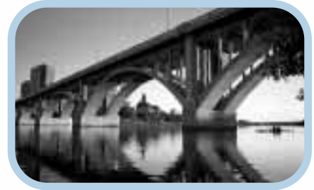
City of Saskatoon

As the Film Commission for the province of Saskatchewan, SaskFilm provides customized and comprehensive locations services for local and offshore producers. Committed to delivering client satisfaction and establishing long term business relationships, the office offers script breakdown services, access to a general and custom photo library, scouting services throughout all areas of the province, as well as ground transportation and accommodation during location scouting for prospective producers.