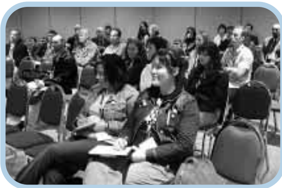
Yorkton Short Film and Video Festival 2004

and television industry has inspired our province's creative talent to seek out stories and myths, heroes and villains and bring them to life on screen in Saskatchewan and around the world.