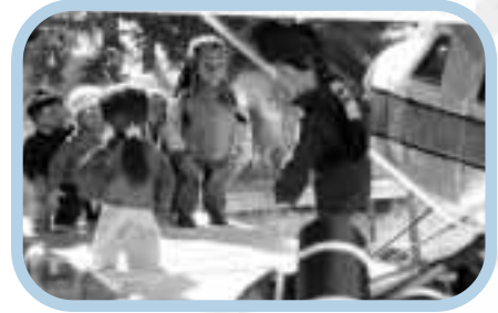
Wapos Bay - The Series, Dark Thunder/Kahani Entertainment

Through SaskFilm's programming initiatives, SCN's commitment to broadcasting Saskatchewan programming, the Saskatchewan Motion Picture Industry Association's professional development programs and other significant funding partners, the Saskatchewan film and television industry has developed a new culture-based economy that fully exploits this province's wealth of stories, people, history and achievements. From Corner Gas and The Tommy Douglas Story , to Pierre le Canadien and Wapos Bay , the film